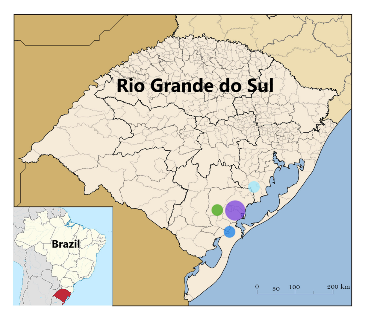
Figure 1. Map with the location of the municipalities (highlighted) of the state of Rio Grande do Sul, Brazil, where the specimens of whiteeared opossums were found and then analyzed for the presence of adenoviruses and rotavirus. The municipalities of origin of the specimens are marked on the map: Rio Grande (dark blue circle), Pelotas (purple circle), Capão do Leão (green circle), and Cristal (light blue circle) (Color figure online).