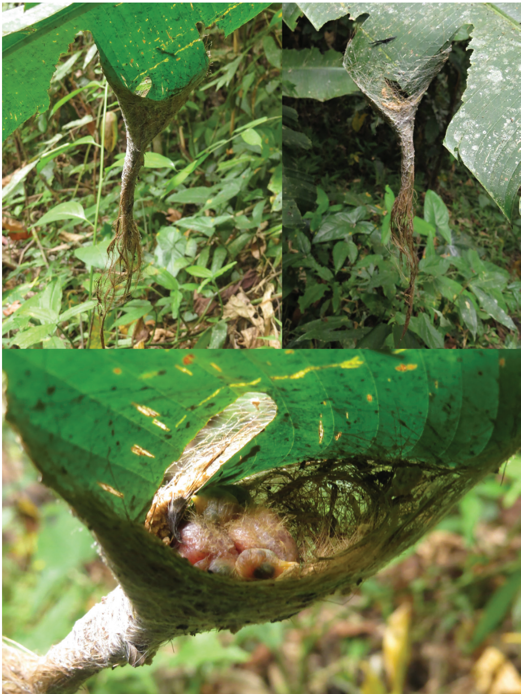
Figure 1. White-bearded Hermit Phaethornis hispidus nest with two nestlings, Rondônia, Brazil, June 2018

was sited 1.01 m above ground in a Costus (Costaceae) plant (Fig. 1). The cup measured 31 × 52 mm internally, and was 130 mm tall externally, with an elongated 'tail' of 70 mm at the base of the cup. The nest comprised fine, pale, dry palm fibres, tightly bound with spider webs, and attached to the underside of a damaged strip of leaf. Overall, the nest's