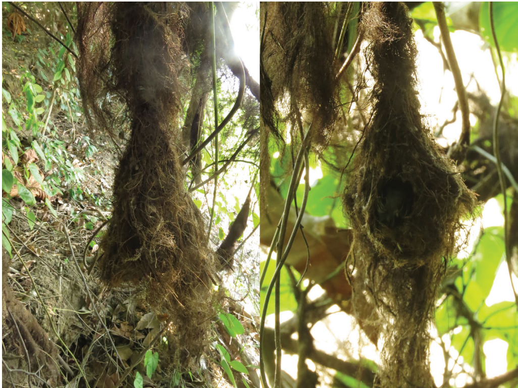
Figure 5. Nest of Spotted Tody-Flycatcher Todirostrum maculatum constructed on the root of a Capsiandra sp. (Fabaceae) near the Madeira River, Rondônia, Brazil, July 2018 (Tomaz Nascimento de Melo)