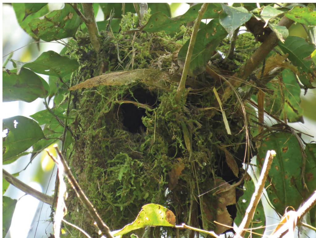
Figure 4. Nest of Specked Spinetail Cranioleuca gutturata in floodplain várzea forest, Rondônia, Brazil, June 2018 (Tomaz Nascimento de Melo)

On 15 June 2018 a nest under construction was found in a lowland forest, c.200 m from the Phaethornis hispidus nest described above. An adult was observed collecting green mosses in a nearby tree and depositing the material in the nest, which was a globular closed construction c.200 mm tall, of dry leaves and green mosses, especially the latter (Fig. 4), with a lateral entrance. The nest was sited on the fork of a branch of Protium sp. (Burseraceae), c.7 m above ground. On returning to the site on 10 July, the nest was apparently empty and no adult was observed. It is unknown whether the nest had been abandoned or not. There are very few published data concerning the species' breeding biology: Remsen (2003) mentioned nestbuilding in mid August in Peru, and the nest reported here was obviously similar to that described previously. A nest found in January, also in Brazil, was of similar shape and size, but with less green moss used in the construction (D. P. Fernandes; https://www.wikiaves.com/1234488 ).