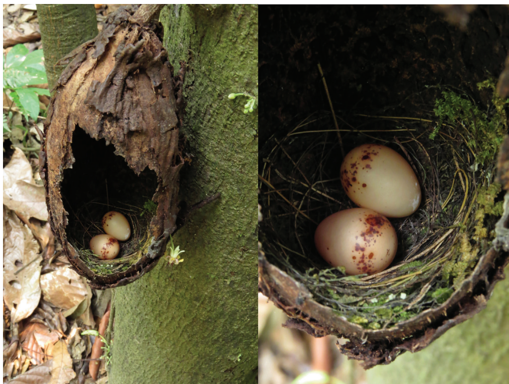
Figure 6. Nest and eggs of Euler's Flycatcher Lathrotriccus euleri in a dried cocoa Theobroma cacao fruit (Malvaceae), Rondônia, Brazil, September 2017

and south-east of its range is well known (Di Giacomo & López Lanús 1998, Aguilar et al. 1999, Marini et al. 2007, Auer & Bassar 2009). There, nests are shallow cups constructed in natural cavities in trees, fallen logs or in ravines, with a mean height above ground of 2 m. The clutch is two or three eggs.