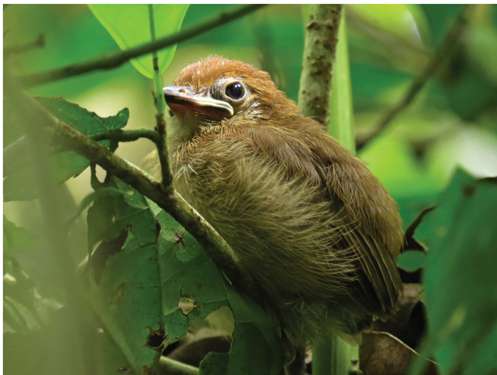
Figure 2. Plain-winged Antshrike Thamnophilus schistaceus fledgling, Rondônia, Brazil, June 2018

shape, composition, height and attachment were similar to those of a nest of the species found in June 2016, in Mato Grosso state, Brazil (C. P. Figueiredo; https://www.wikiaves.com/1234488 ). The elongated leaf of Costus sp. used here, offered a similar substrate to the leaves of understorey palms, which are among the most frequently used nest substrates of the genus Phaethornis (Ruschi 1949, Oniki 1970, Greeney et al. 2018).